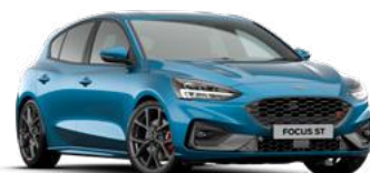
Ford Performance Blue*