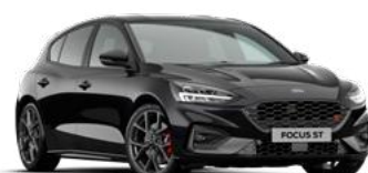
Agate Black Metallic*