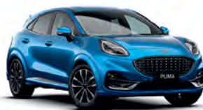
Desert Island Blue**^